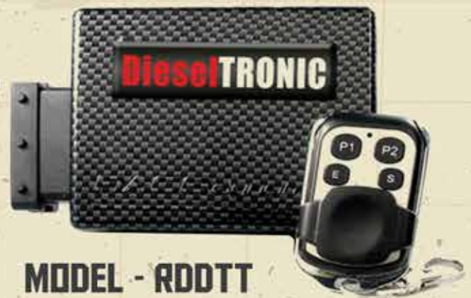
MODEL - RDDTT