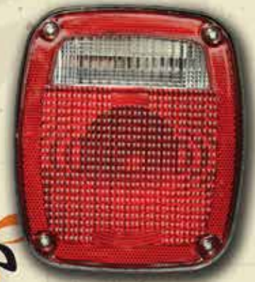
MODEL - 73829