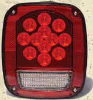
MODEL - BBLTL